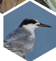
Clockwise from top: Purple Gallinule ; Barred Owl ; Painted Bunting ; Common Tern ; Bald Eagle ; Sedge Wren